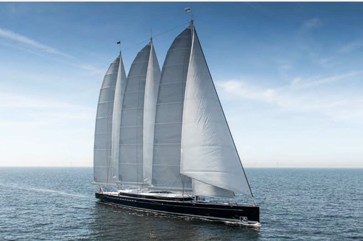
Sea Eagle II (2020)

CUSTOMER: Pendennis TYPE: Sailing Yacht (39.4 m) TYPE OF WORK: Newbuild SCOPE OF SUPPLY: System, Switchboards, AMCS and Battery charge