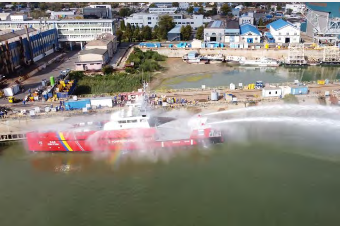
Damen Stan Patrol 5009 emergency and response vessel

CUSTOMER: Damen Schelde Naval Shipbuilding TYPE: Offshore Patrol Vessel (108.4 m) TYPE OF WORK: Newbuild SCOPE OF SUPPLY: Complete electrical systems integration, installing, supervising on site and commissioning.