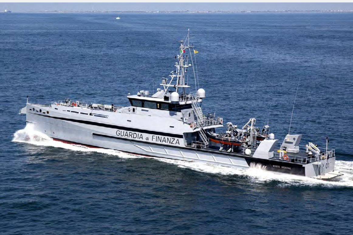
Stan Patrol 5509 (2015)

CUSTOMER: Damen Shiprepair Dunkerque TYPE: Research Vessel (50.9 m) TYPE OF WORK: Refit SCOPE OF SUPPLY: Life time extension. Electrical Installation.