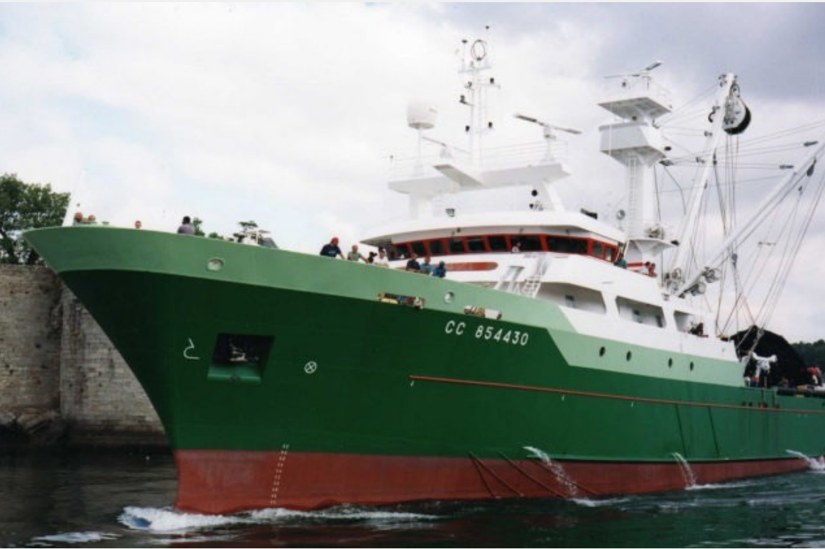
Tuna purse seiner 67m – C345 (2019)

CUSTOMER: Piriou France TYPE: Tuna vessel (67m) TYPE OF WORK: Newbuild SCOPE OF SUPPLY: Main Switchboard