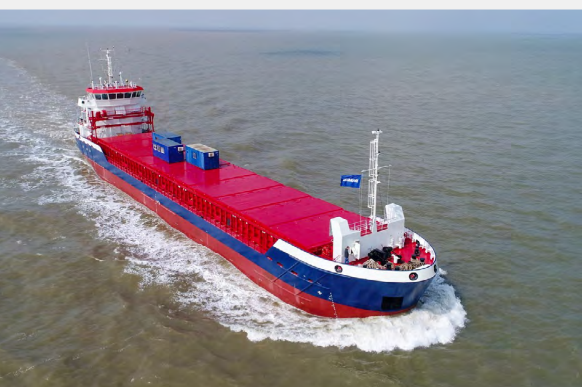
Sophie & Benabell G. YN 559012-13 (2021)

CUSTOMER: Damen Shipyards Gorinchem, Yichang TYPE: Liquified Gas Carrier (LGC) 6000 LNG s, Bunkering vessel (100 m) TYPE OF WORK: Newbuild SCOPE OF SUPPLY: Electrical Engineering and Integration, Equipment delivery, Supply and supervising of loose equipment and cables, Commissioning.