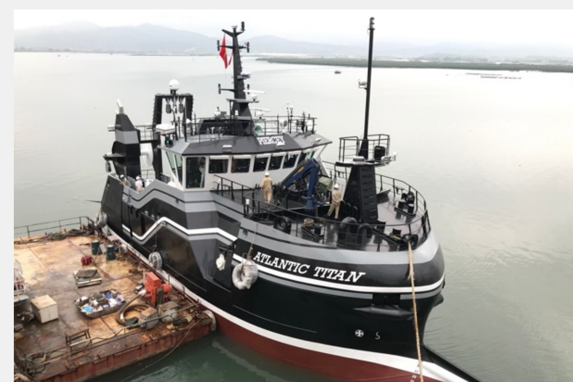
Atlantic Titan - Fishing trawler 30m (2019)

CUSTOMER: Damen Shipyards Gorinchem, Yichang TYPE: Combi Freighter 3850 - multipurpose carriers (90 m) TYPE OF WORK: Newbuild SCOPE OF SUPPLY: Complete electrical engineering, cables & equipment delivery and commissioning works for: power generation and power distribution system, motor starters, alarm monitoring and control system, fire detection system, public address system, telephone system, etc.