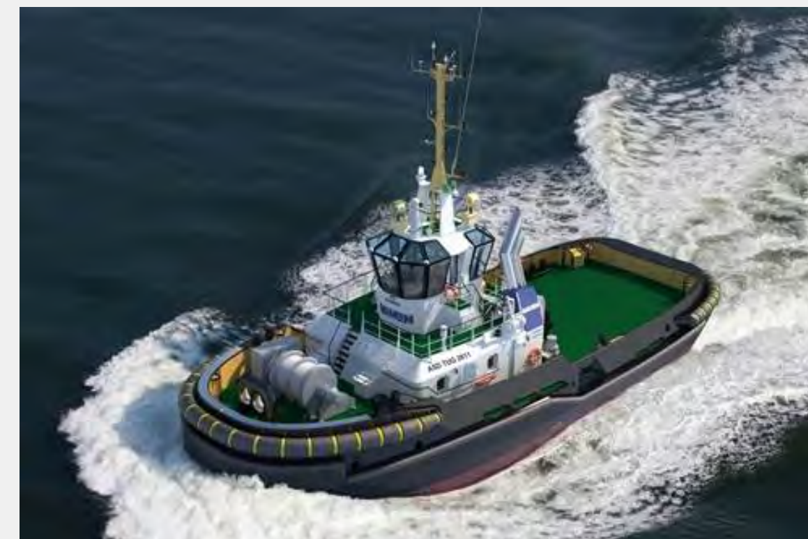
ASD2811 YN513213-14 (2020)

CUSTOMER: Damen Shipyards Gorinchem TYPE: Ice Tug(34 m) TYPE OF WORK: Newbuild SCOPE OF SUPPLY: Switchboards