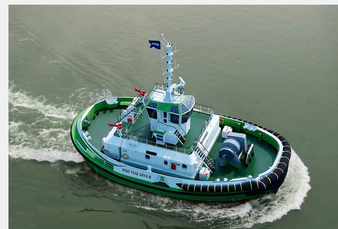
RSD2513 YN515011-16 (2020)

CUSTOMER: Damen Shipyards Gorinchem TYPE: Tug boat (23 m) TYPE OF WORK: Newbuild SCOPE OF SUPPLY: Switchboards and consoles.