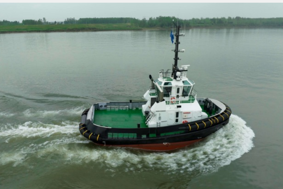
ASD2111 YN510401-10 (10 ships) (2023-now)

CUSTOMER: Damen Gorinchem TYPE: Electric tugboat 25m TYPE OF WORK: Newbuild SCOPE OF SUPPLY: Switchboard package & consoles