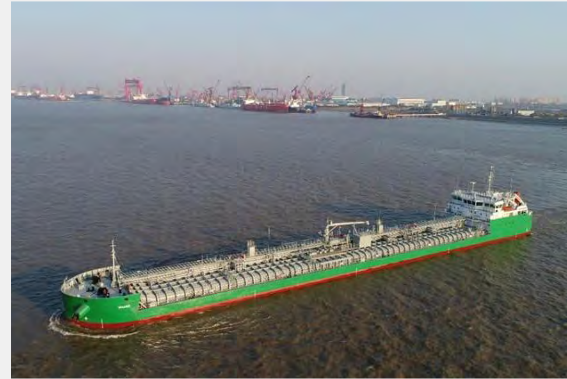
Maaike and Linda (2018)

CUSTOMER: Piriou France TYPE: Tuna vessel (67m) TYPE OF WORK: Newbuild SCOPE OF SUPPLY: Main Switchboard