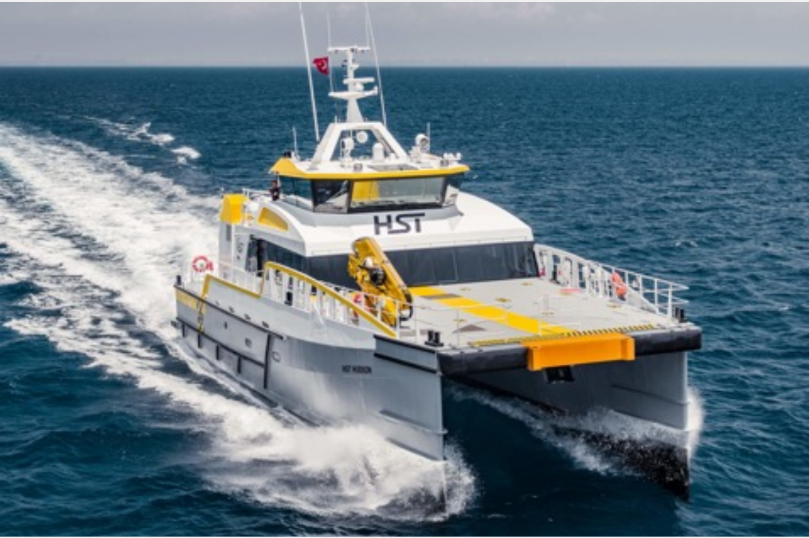
FCS2710 YN 532926-29/32/33 (06 ships) (2024)

CUSTOMER: Damen Gorinchem TYPE: Tugboat 27m TYPE OF WORK: Newbuild SCOPE OF SUPPLY: Switchboard package