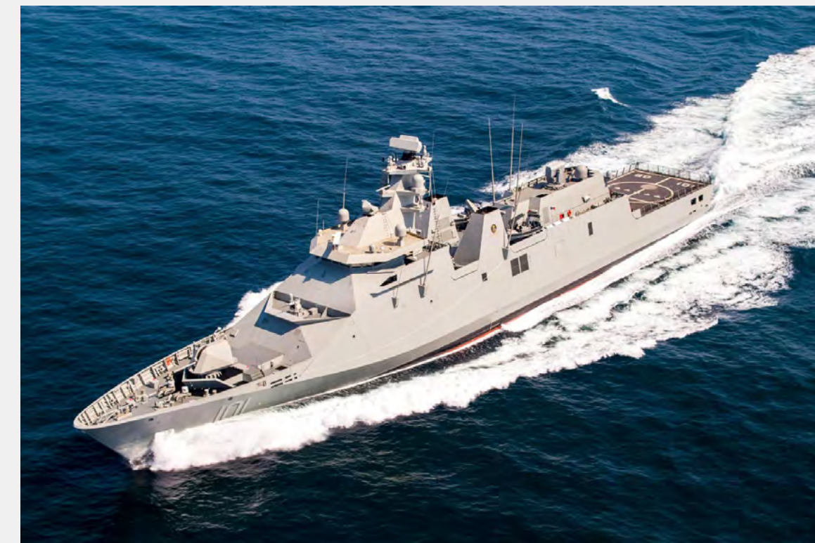
Arm Juarez (2020)

CUSTOMER: Damen Shipyards Gorinchem TYPE: Offshore Patrol Vessel 1900 (90 m) TYPE OF WORK: Newbuild SCOPE OF SUPPLY: Electrical package delivery. Engineering, installing, commissioning and supervision.