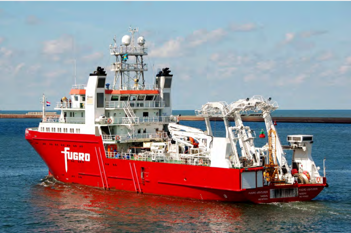
Fugro Venturer (2017)

CUSTOMER: Fassmer TYPE: Research & Survey vessel (72 m) TYPE OF WORK: Newbuild SCOPE OF SUPPLY: System integration, vessel automation, power distribution system; navigation and communication system, consoles.