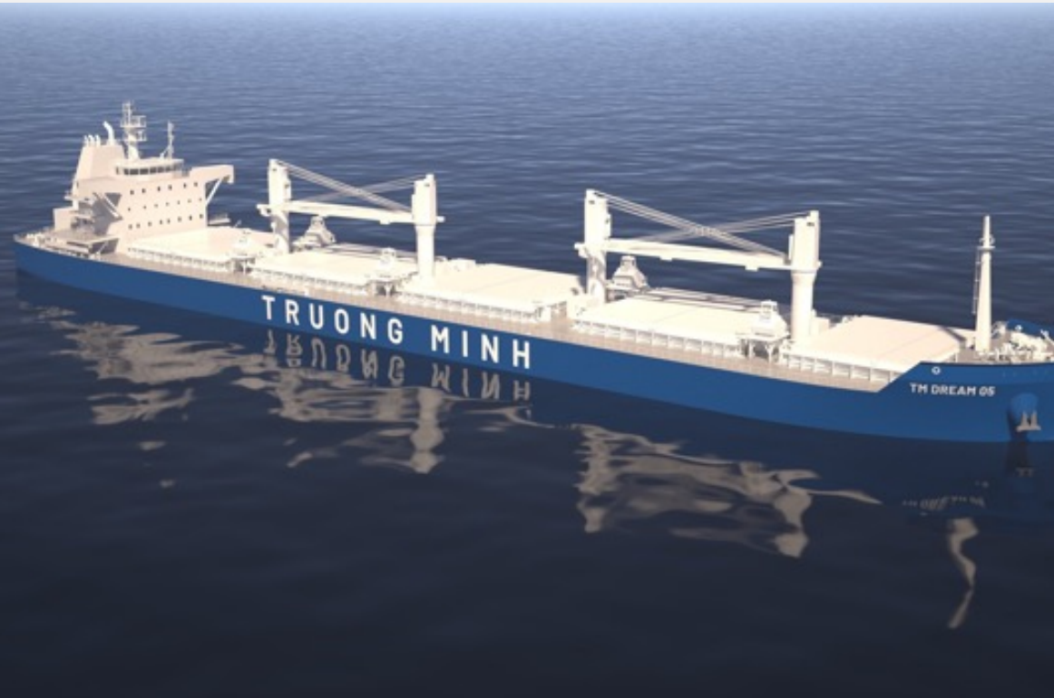
TM Dream 05-06 45,000DWT bulk carrier (02 ships) (2024)

CUSTOMER: Dong Bac shipbuilding company TYPE: bulk carrier 65,000DWT TYPE OF WORK: Newbuild SCOPE OF SUPPLY: Engineering all switchboards, switchboards package & AMS.