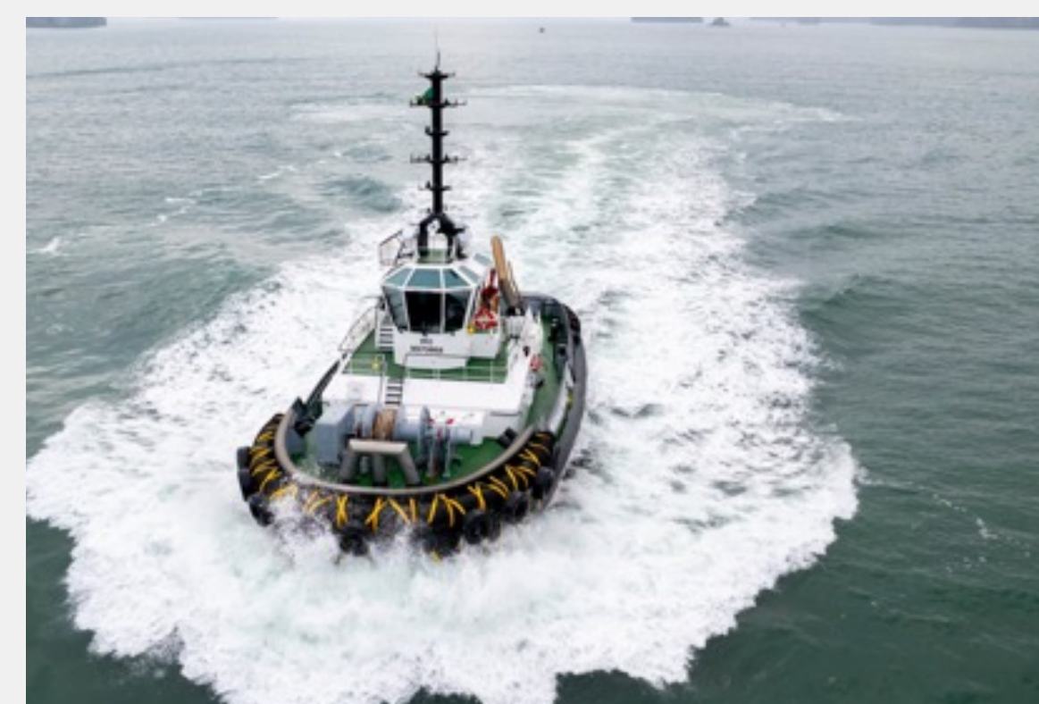
ASD 2811 YN513204-28 (25 ships) (2018-2023)

CUSTOMER: Damen Gorinchem TYPE: Tugboat 25m TYPE OF WORK: Newbuild SCOPE OF SUPPLY: Switchboard package & consoles