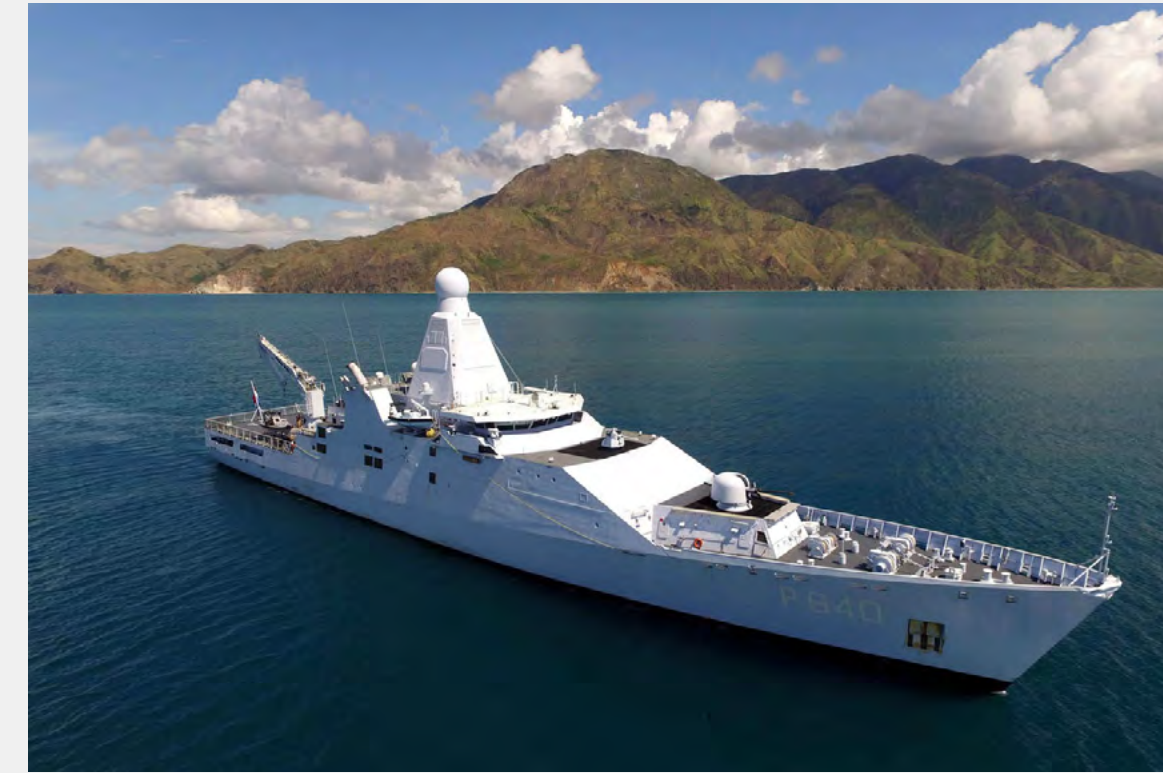
Zr. Ms. Holland (2012)

CUSTOMER: Damen Schelde Naval Shipbuilding TYPE: Offshore Patrol Vessel (108.4 m) TYPE OF WORK: Newbuild SCOPE OF SUPPLY: Complete electrical systems integration, installing, supervising on site and commissioning.