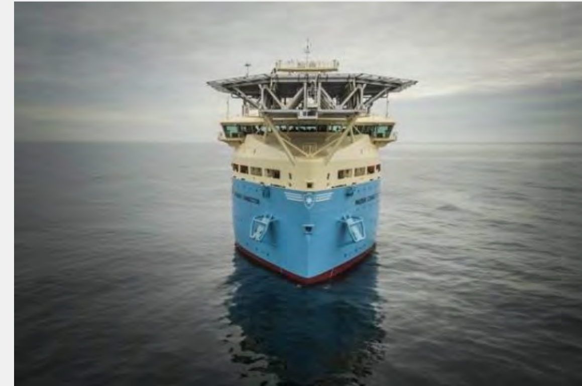
Maersk Connector (2016)

CUSTOMER: Fassmer TYPE: Research & Survey vessel (72 m) TYPE OF WORK: Newbuild SCOPE OF SUPPLY: System integration, vessel automation, power distribution system; navigation and communication system, consoles.