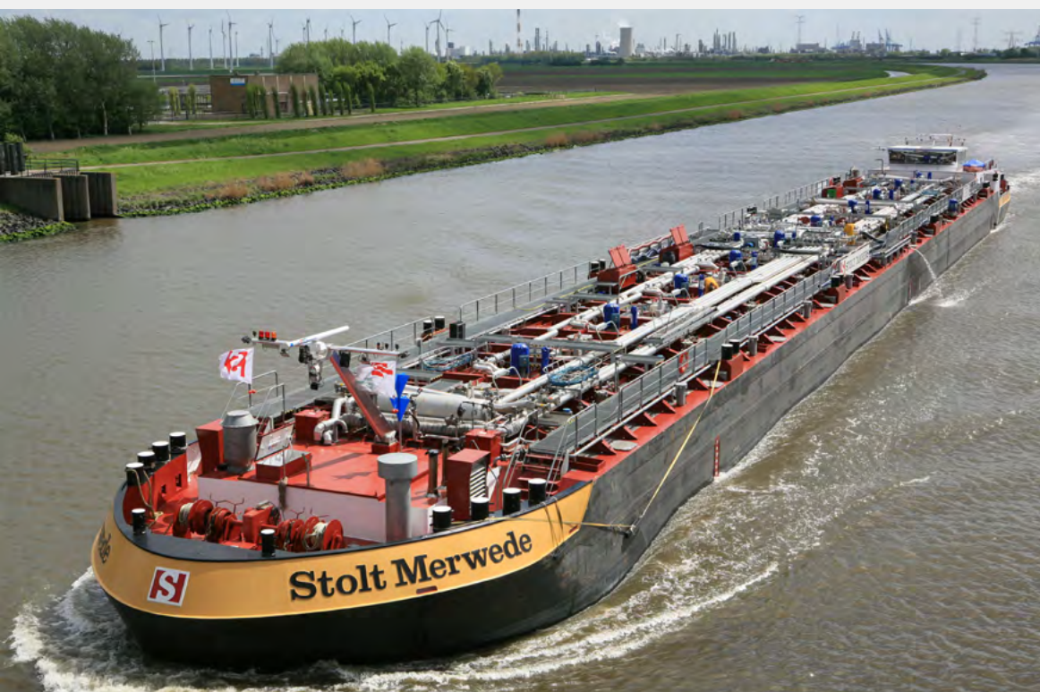
Stolt Waal, Main, Maas, Mosel, Rhine and Merwede (2018)

CUSTOMER: Damen Shipyards Gorinchem TYPE: 8.000 m 3 oil tankers TYPE OF WORK: Newbuild SCOPE OF SUPPLY: Engineering, installation and commissioning of complete electrical installation, alarm, monitoring and control systems, electrical distribution systems.