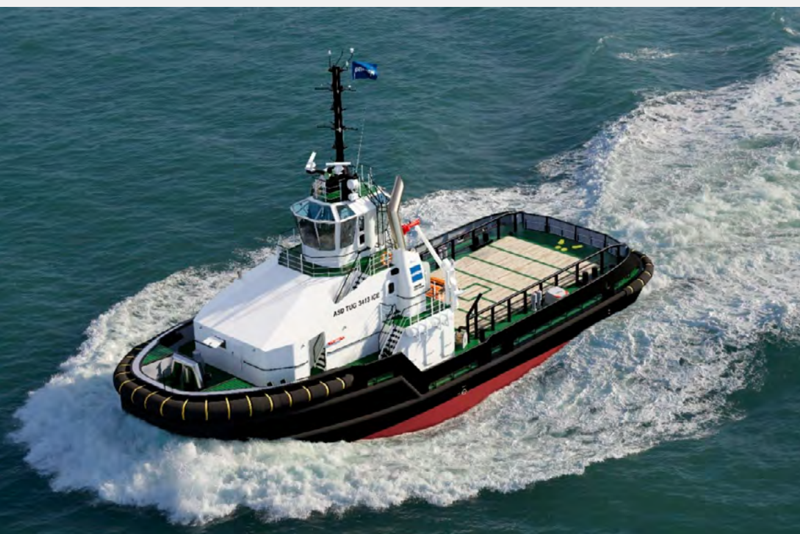
ASD 3413 YN 512801 (2021)

CUSTOMER: Damen Gorinchem TYPE: Tugboat 34m TYPE OF WORK: Newbuild SCOPE OF SUPPLY: Switchboard package & consoles