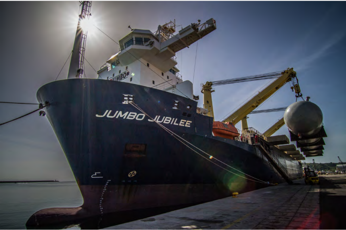
Jumbo Jubilee (2019)

CUSTOMER: Jumbo Maritime TYPE: Heavy Load Carrier (145 m) TYPE OF WORK: Service SCOPE OF SUPPLY: Power distribution system.