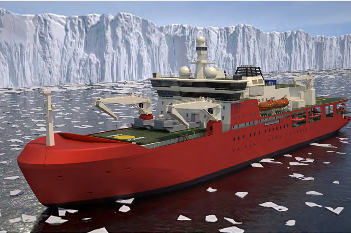
Nuyina, YN 417000 (2021)

CUSTOMER: Damen Schelde, Galați TYPE: ASRV Icebreaker, Research vessel (160 m) TYPE OF WORK: Newbuild SCOPE OF SUPPLY: Electrical Engineering and Integration, Equipment delivery, Supply and Installation of loose equipment and cables.