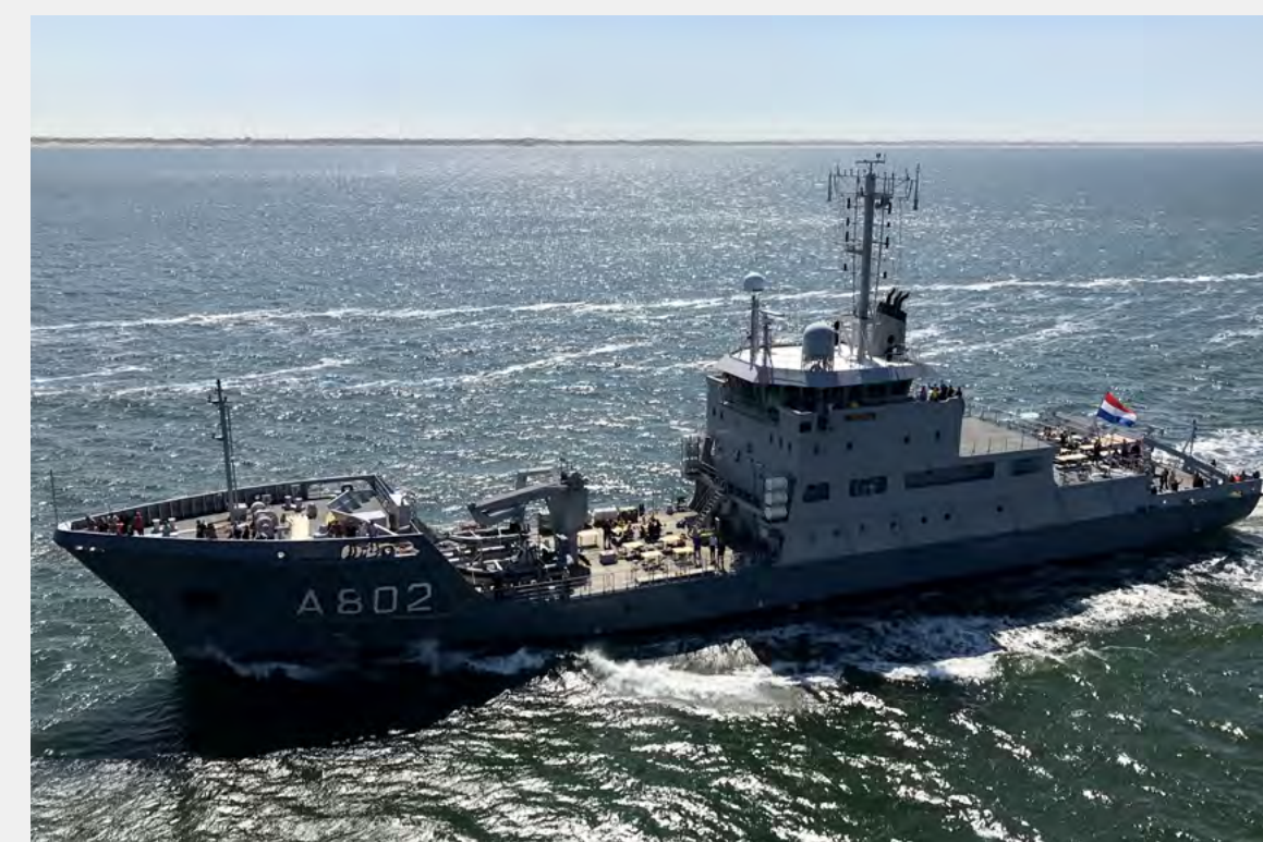
Zr. Ms. Snellius (2020)

CUSTOMER: Damen Shipyard Den Helder TYPE: Naval Auxiliary Vessel (65 m) TYPE OF WORK: Refit SCOPE OF SUPPLY: Mid-Life upgrade and maintenance.