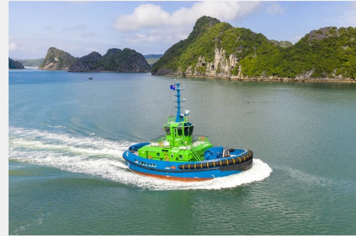
RSD 2513 E-tug YN514001-07 (07 ships) (2021-now)

CUSTOMER: Damen Gorinchem TYPE: Tugboat 27m TYPE OF WORK: Newbuild SCOPE OF SUPPLY: Switchboard package