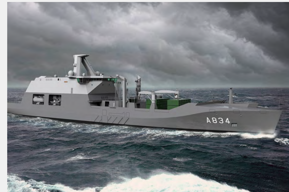
CSS Den Helder

CUSTOMER: Damen Shipyards TYPE: Emergency and response vessel TYPE OF WORK: Newbuild SCOPE OF SUPPLY: E-package, engineering, installing, commissioning