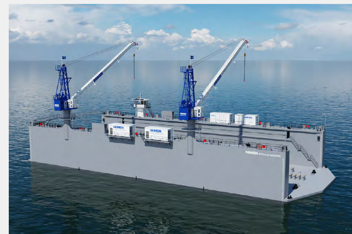
Modular Dry Dock 8026-4 (2017)

CUSTOMER: DEME TYPE: Cable Layer (161 m) TYPE OF WORK: Refit SCOPE OF SUPPLY: Infrastructure (cable routing, cable trays).