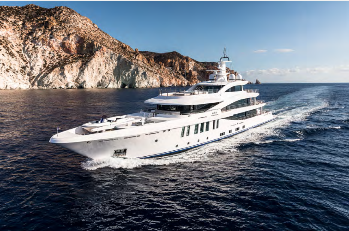
Stella M, Amels BN18802 (2021)

CUSTOMER: Damen Yachting TYPE: Yacht (60 m) TYPE OF WORK: Newbuild SCOPE OF SUPPLY: E-installation, Energy Storage, Navcom