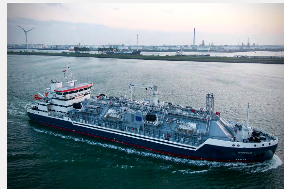
Optimus YN 559014 (2021)

CUSTOMER: Severnav Shipyard TYPE: 6500 m 3 liquified gas tanker and 8600 m 3 gas tankers TYPE OF WORK: Newbuild SCOPE OF SUPPLY: Complete electrical package, including engineering, commissioning, alarm, monitoring and control systems.