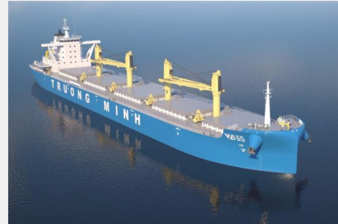
VB65-01 & VB65-02 65,000DWT bulk carrier (02 ships) (2023- 2024)

CUSTOMER: Dong Bac shipbuilding company TYPE: bulk carrier 65,000DWT TYPE OF WORK: Newbuild SCOPE OF SUPPLY: Engineering all switchboards, switchboards package & AMS.