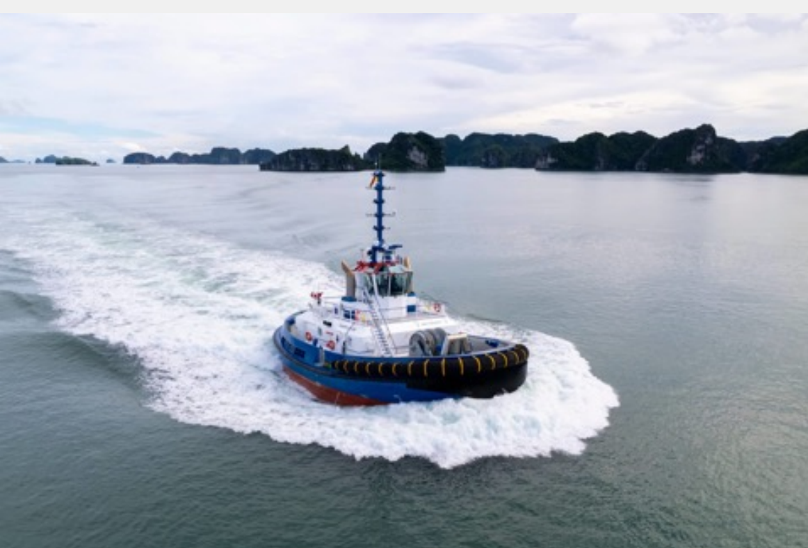
RSD2513 YN515011-50 (40 ships) (2020-now)

CUSTOMER: Damen Gorinchem TYPE: Tugboat 23m TYPE OF WORK: Newbuild SCOPE OF SUPPLY: Switchboard package & consoles