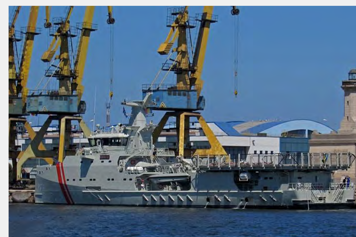
Arialah/OPV 6711 UAE (2016)

CUSTOMER: Damen Schelde Naval Shipbuilding TYPE: Guided-missile Frigate (105.1 m) TYPE OF WORK: Newbuild SCOPE OF SUPPLY: Engineering and integration of platform system, materials and equipment/system delivery, installing of cable and set to work activities.