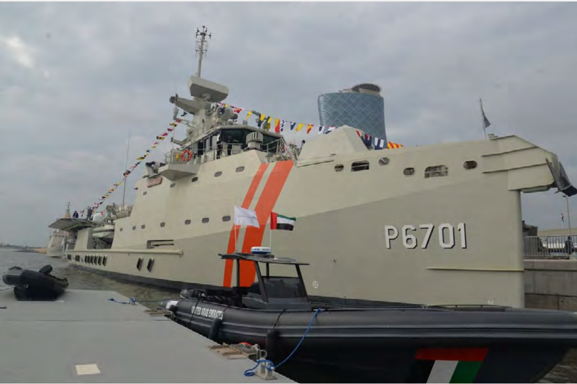
Hmeem/OPV 6711 UAE (2016)

CUSTOMER: Damen Shipyards Gorinchem TYPE: Offshore Patrol Vessel (67 m) TYPE OF WORK: Newbuild SCOPE OF SUPPLY: Electrical package delivery. Engineering, installing and commissioning.