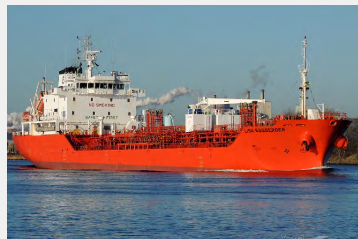
Essberger vessels: Lisa, Lucy, Caroline, Ursula, Anneliese and Wilhelmine (2016)

CUSTOMER: Royal Bodewes TYPE: Cement Carrier (103 m) TYPE OF WORK: Newbuild SCOPE OF SUPPLY: Complete electrical installation, automation systems, switchboards and consoles.