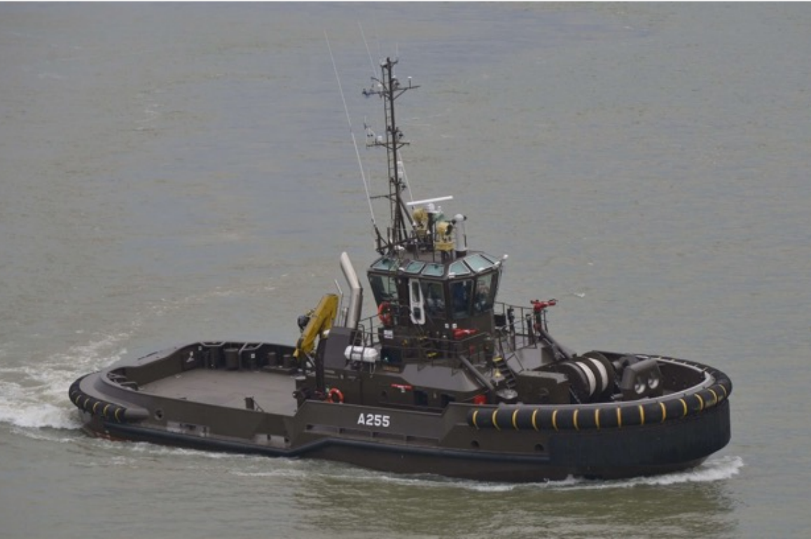
ASD3010ICE YN512615-34 (20 ships) (2018-2023)

CUSTOMER: Damen Gorinchem TYPE: Tugboat 30m TYPE OF WORK: Newbuild SCOPE OF SUPPLY: Cables, out fitting materials, switchboard package & consoles consoles