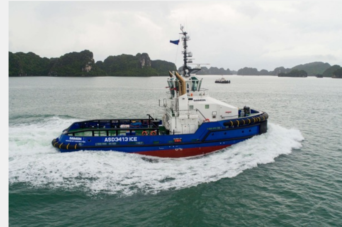
ASD3413ICE YN512801-03 (03 ships) (2022)

CUSTOMER: Damen Gorinchem TYPE: Tugboat 30m TYPE OF WORK: Newbuild SCOPE OF SUPPLY: Cables, out fitting materials, switchboard package & consoles consoles