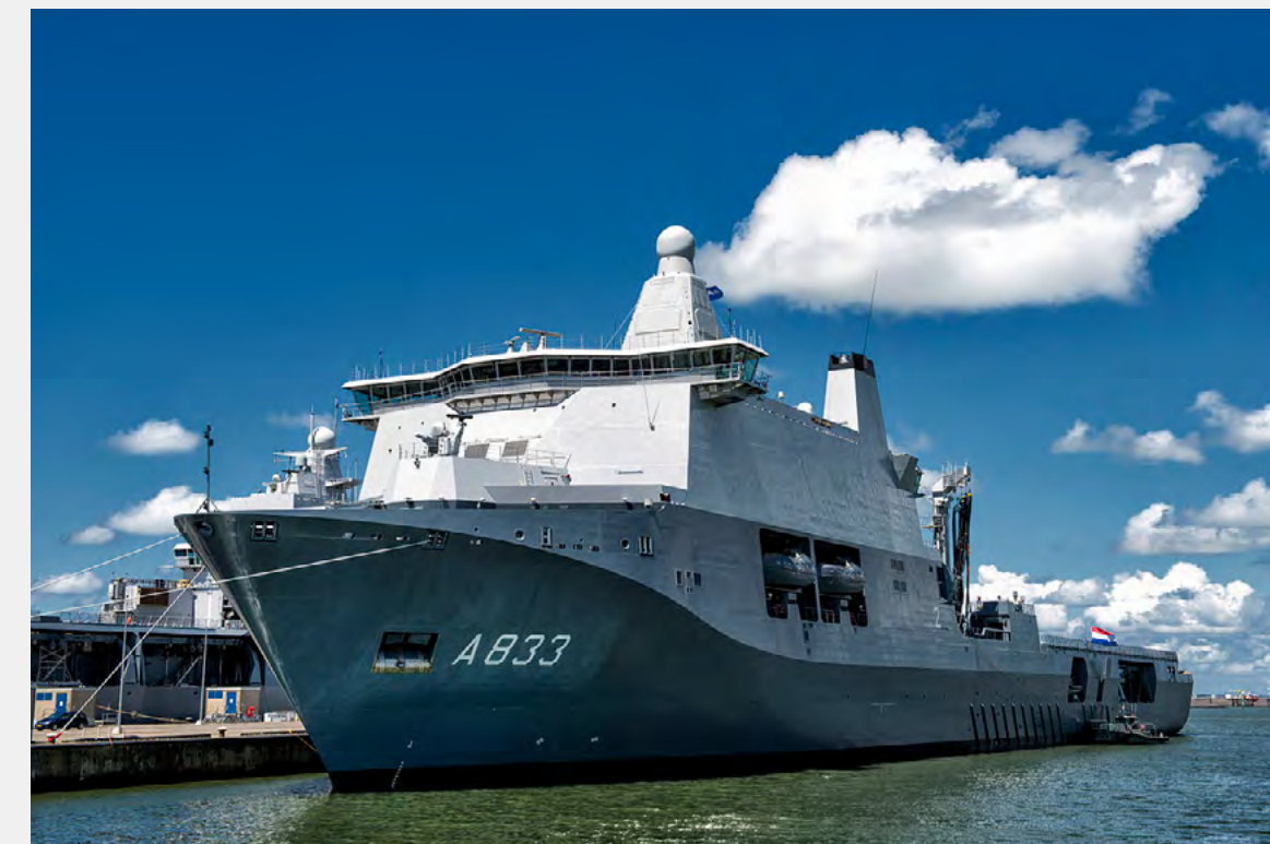
Zr. Ms. Karel Doorman (2015)

CUSTOMER: Damen Shipyards Gorinchem TYPE: Offshore Patrol Vessel (55 m) TYPE OF WORK: Newbuild SCOPE OF SUPPLY: Electrical package delivery. Engineering, installing and commissioning.