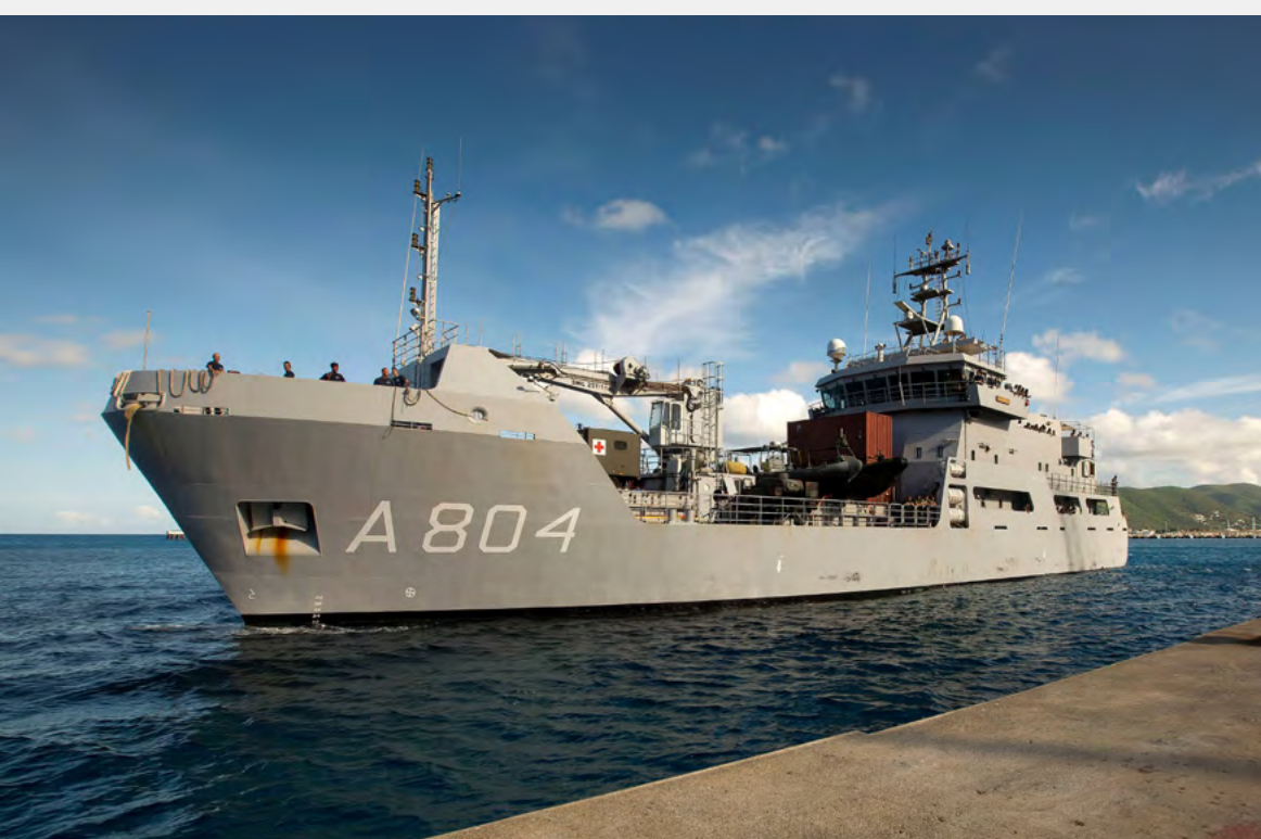
Zr. Ms. Pelikaan (2020)

CUSTOMER: Damen Schelde Naval Shipbuilding TYPE: Long Range Oceanic Patrol Vessel (107.5 m) TYPE OF WORK: Newbuild SCOPE OF SUPPLY: Complete electrical systems integration, installing, supervising on site and commissioning.